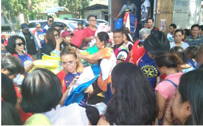
4 th stop – Old Bulatukan, North Cotabato