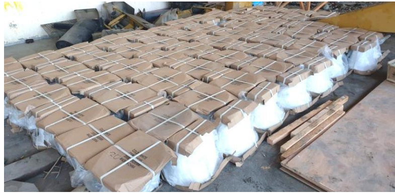
2 nd stop – Magsaysay Davao del Sur