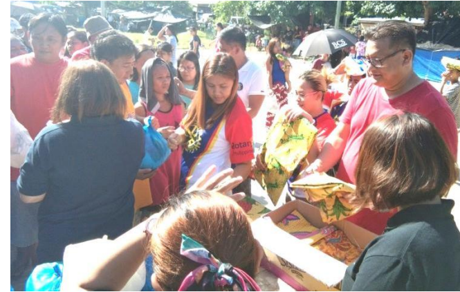
1 st stop – Brgy. Mahayahay, Matanao, Davao del Sur